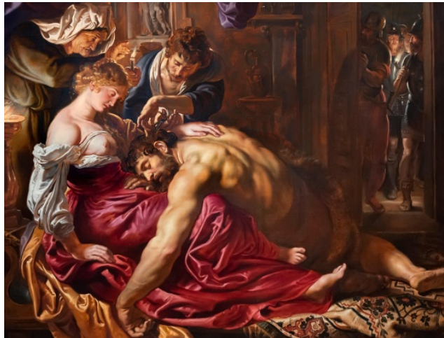
Samson and Delila. By Peter Paul Rubens. National Gallery, London. about 1609.