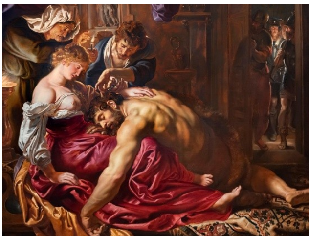
Samson and Delila. By Peter Paul Rubens. National Gallery, London. about 1609.